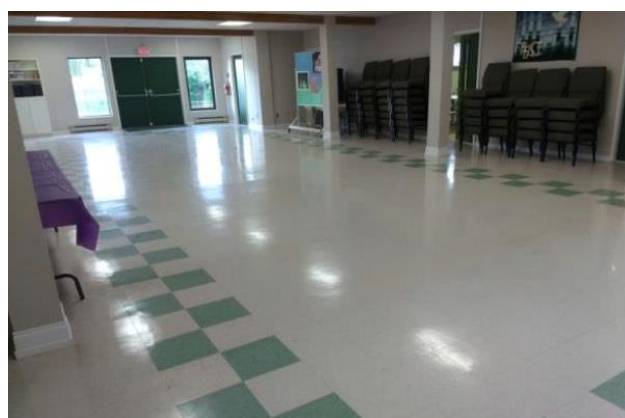
Hall (28ft x 50') back entry doors