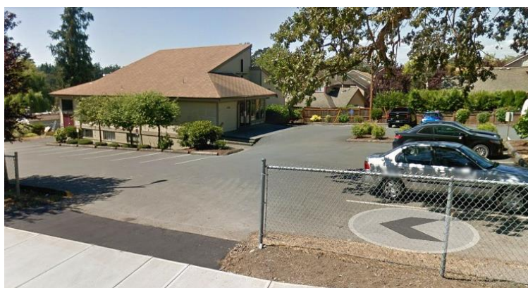
Church & Parking Lot (off Travino Lane)