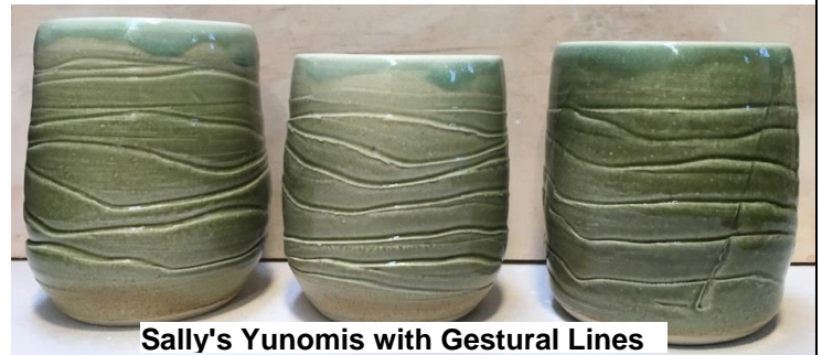
Sally's Yunomis with Gestural Lines

I think that it might have been that - Steven's opening himself up to critique - along with the support of the potters around me that helped me to let go. My thrown work has always been very plain, measured, and safe. I have not experimented with making pots of more than two or three pounds. But something happened in this workshop that led me to experiment with different shapes and altering my pots. I was so darned excited when I altered a pot so that it that reminded me of the ocean, I think I actually shouted out something like, "Hot damn, I did it!" (My apologies to my fellow students if I disturbed you.)